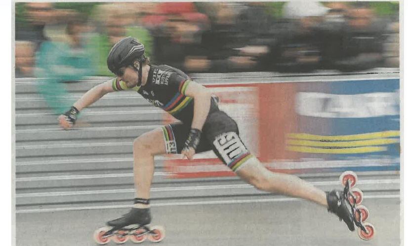
Auf Platz zwei sprintete Weltmeister Simon Albrecht zum Auftakt des Speedskating-Kriteriums in Groß-Gerau.

SPEEDSKATING Simon Albrecht und Leonie Imhof glänzen beim Sprintcup zum Auftakt des Internationalen Kriteriums