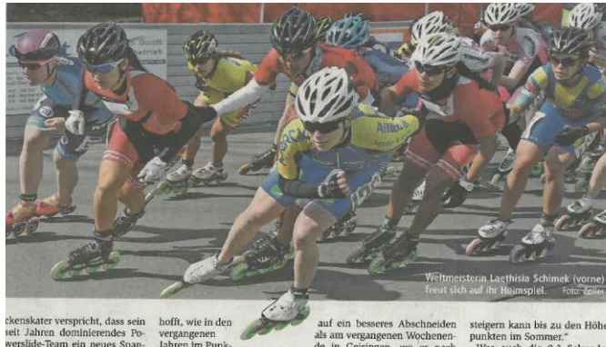
ckensater verspricht, dass sein seit Jahren dominierendes Powerslide-Team ein neues Spannungselement bringt. Hoffentlich, wie in den vergangenen Jahren im Park, auf ein besseres Abschneiden als am vergangenen Wochenende. Die Belgierinnen werden sich steigern kann bis zu den Höhepunkten im Sommer."

SPEEDSKATING An drei Tagen sind 699 Starter aus 33 Nationen im Einsatz