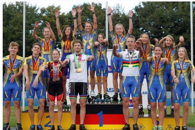
19 BGGG-Athletes with 51 German titles

http://www.1730live.de/meisterlicher-speedskater/