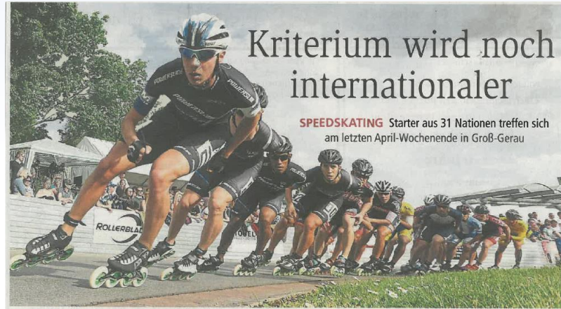
Die unumstrittene Führungskraft in der Statistik des Kriteriums: Der Belgier Bart Swings hat in Groß-Gerau seinen achten Gesamtsieg in Folge im Blick.