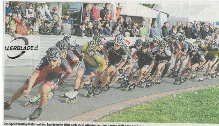
Das Speedskating-Kriterium des Sportvereins Blau-Gelb lockt Athleten aus der ganzen Welt nach Groß-Gerau.